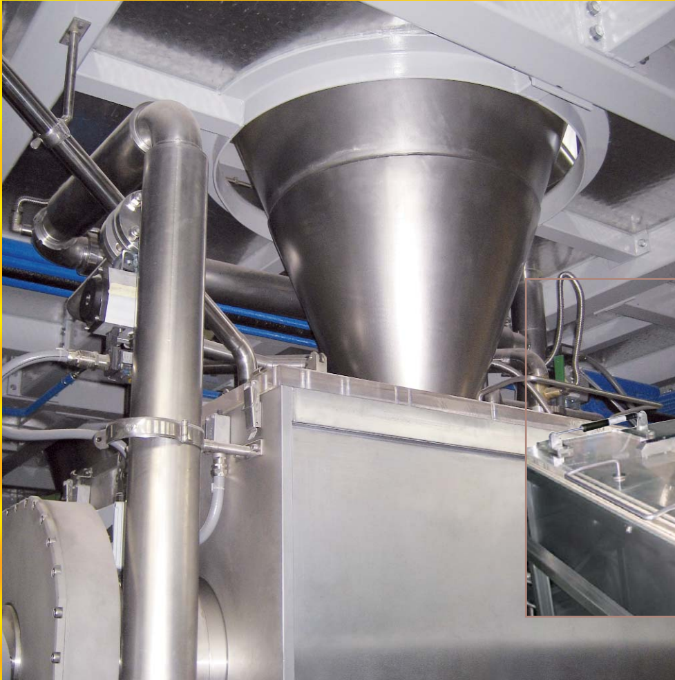
◀ Industrial application of the mixer on load cells for automatic metering of the ingredients