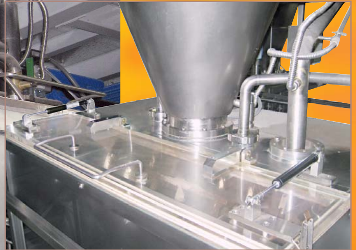
▲ Top view of the mixer industrial application